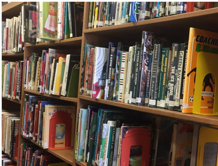
(Algoma Public Library)

In addition, the Luxemburg-Casco School District has opened the Luxemburg-Casco High School Library for public use, Monday-Friday from 3:30PM-5:30PM. And, on Thursday, November 9 th , the Algoma Public Library will be at Luxemburg-Casco Primary School from 4PM-7PM to print library cards for residents during parent-teacher conferences.